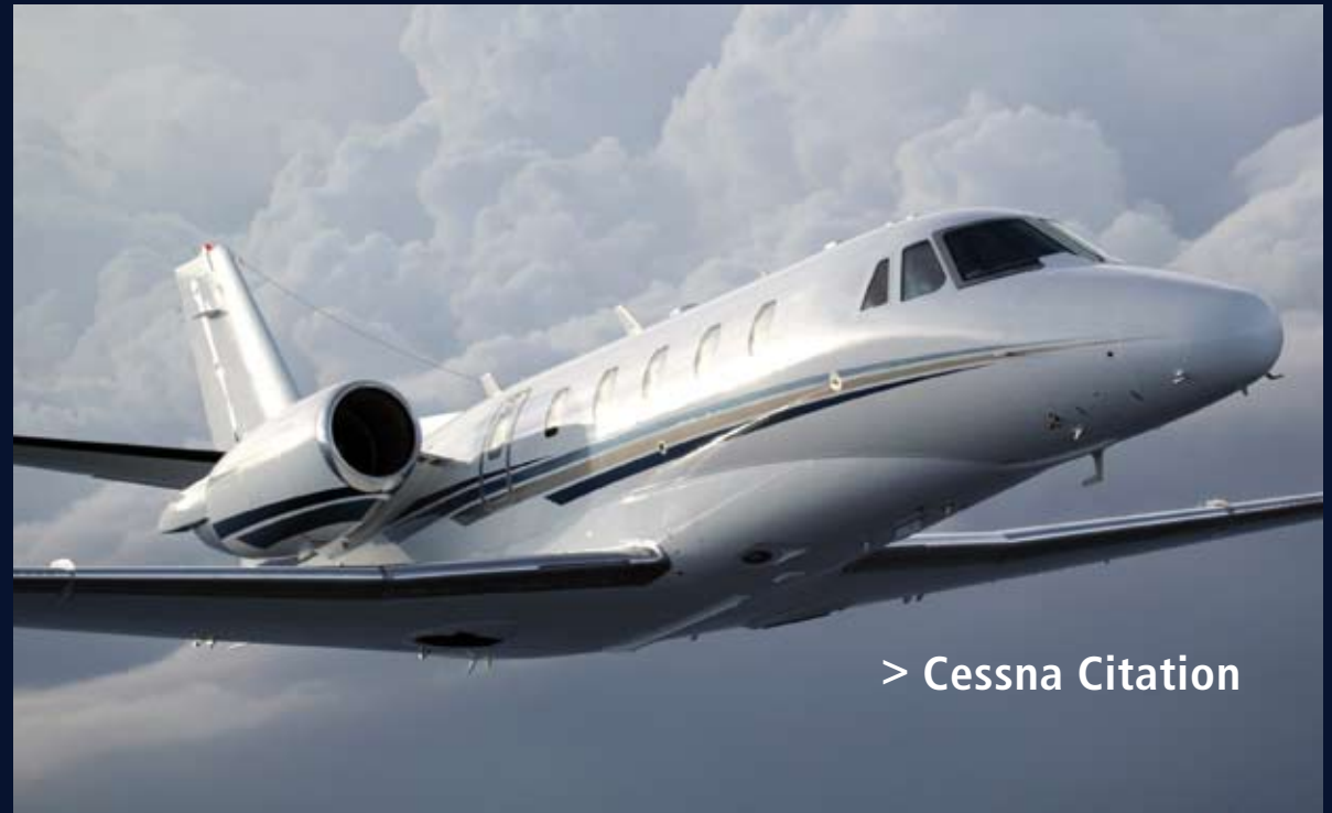
> Cessna Citation

>> Our experience is your benefit. See for yourself if we can be in charge for you. <<