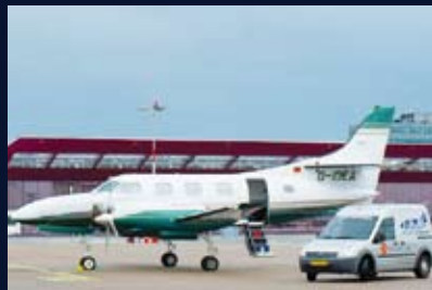
AMS: 14000 m² hangar