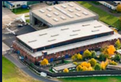
CGN: 5400 m² hangar

CGN / EDDK: +49 163 6995 089 AMS / EHAM: +31 621 594 749 KLU / LOWK: +43 676 933 47 61 aog-phenom@nayak.aero