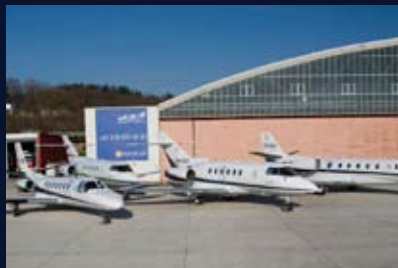
KLU: 300 m² hangar